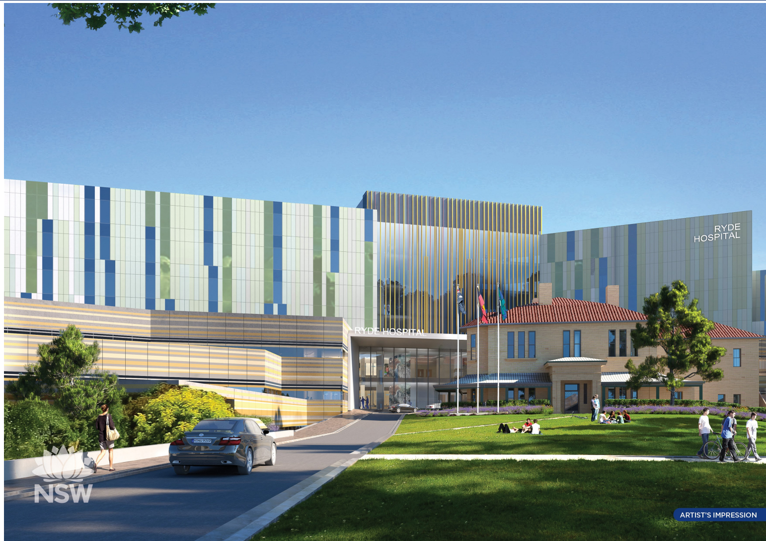
The latest designs of the Ryde Hospital Redevelopment showing the front of the hospital from Denistone Road.