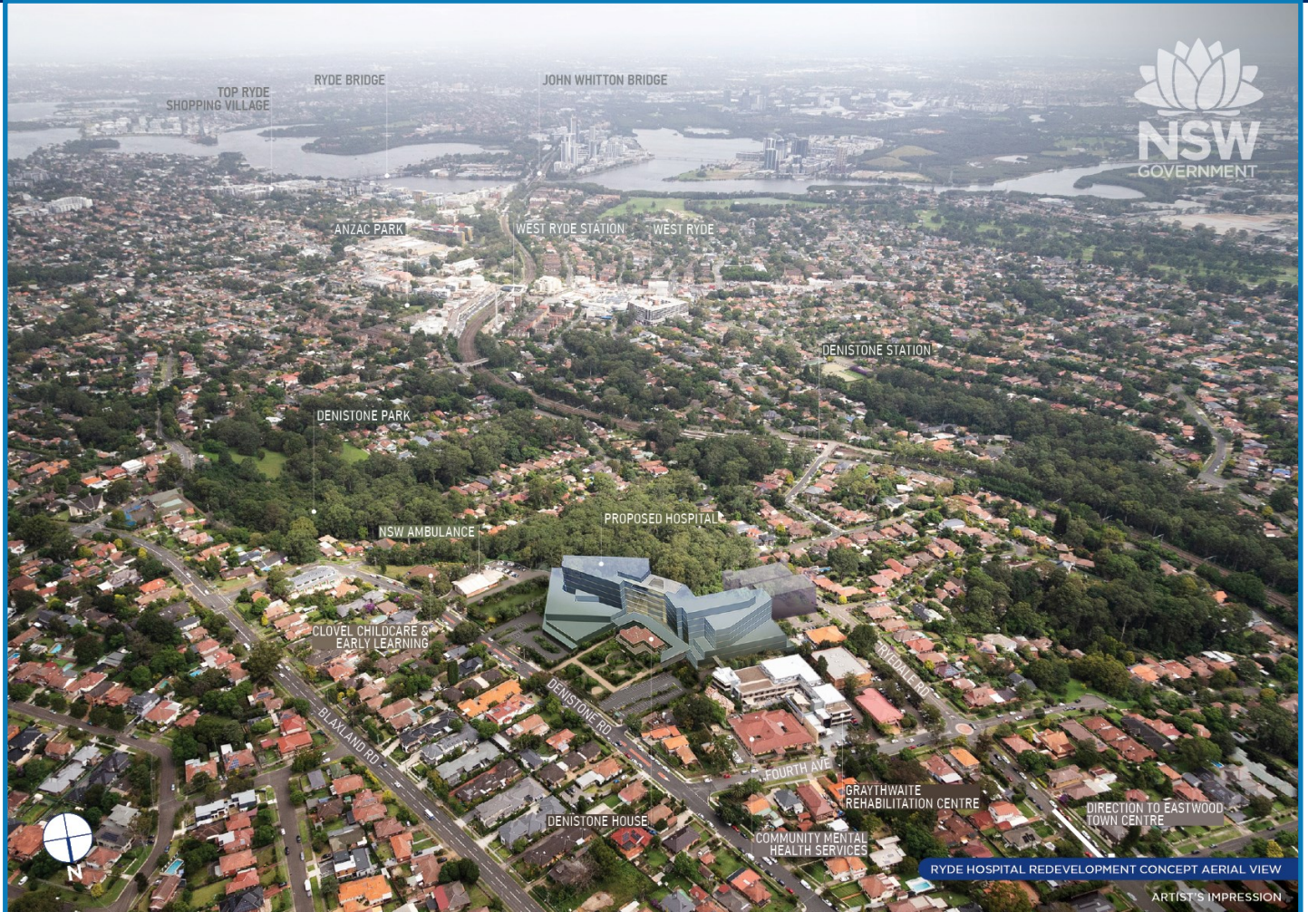
An aerial concept design of the Ryde Hospital redevelopment showing the location of the proposed hospital building and car park within the surrounding community.