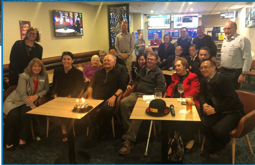
Above: members of the Ryde Hospital redevelopment team provided a briefing to the Eastwood Chamber of Commerce, followed by a Q&A session. Photo 9 May 2022.