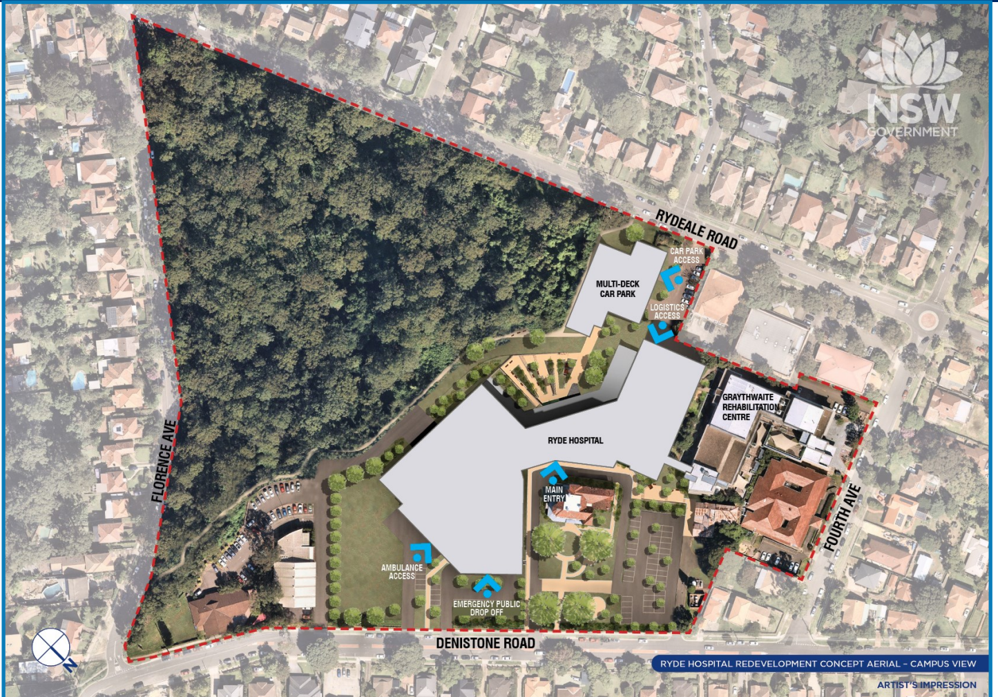
The masterplan for the Ryde Hospital redevelopment showing the location of the proposed building and its connections with the Blue Gum High Forest, existing buildings (including Denistone House) and green space to be incorporated.